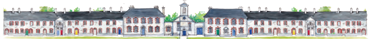
23. Kingston College