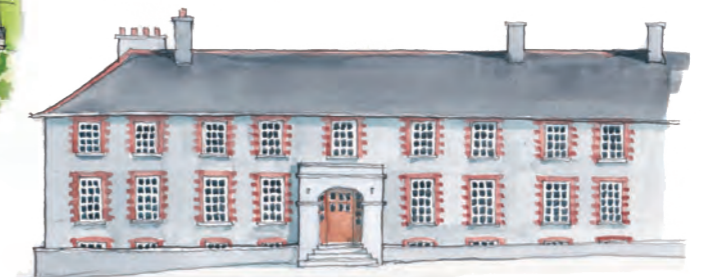
27. Kingston Arms Hotel