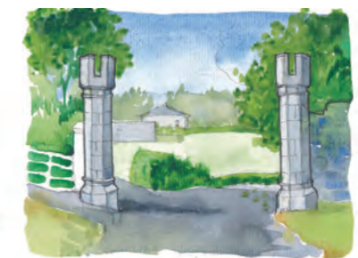
24. Entrance to site of Mitchelstown Castle