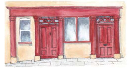
19. Shop front, King's Street