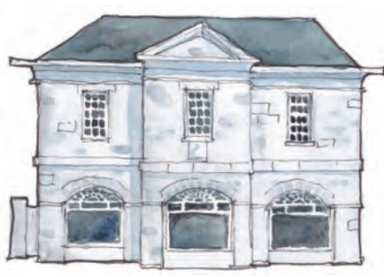
3. Market House