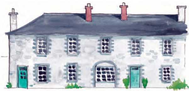
2. Kingston orphanage