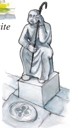
32. Statue of St Fanahan

There are a number of heritage signs in the town and environs with more detailed information.