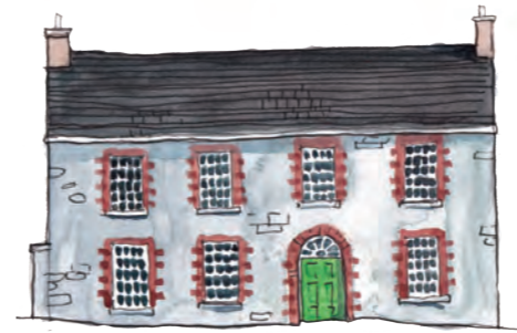
17. Kingston School