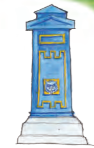
22. Water Pump