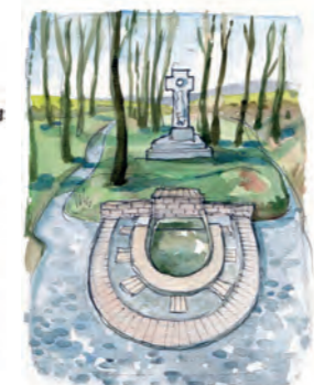
5. St Fanahan's Well