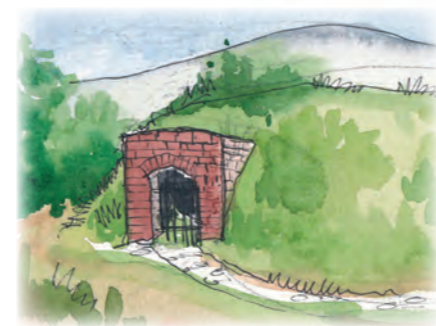
16. Ice House