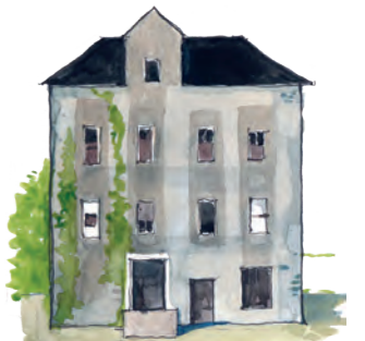
28. Manor Mill