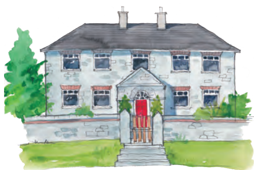
11. Fever hospital