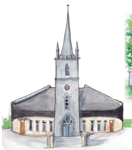
6 Church of Mary Conceived Without Sin