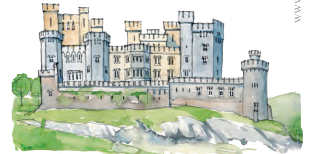
25. Mitchelstown Castle (now demolished)