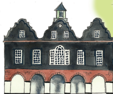
6. Market House