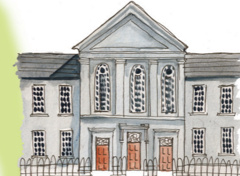
14. Convent of Mercy