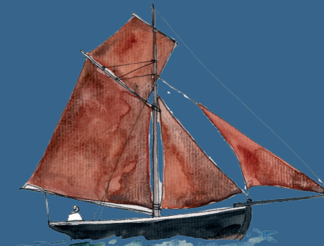
A Kinsale Hooker

Fishing was another key element of Kinsale's economy. In 1829, it is recorded that 4,612 men and boys were employed on fishing boats and another 1,415 were working in ancillary industries such as coopering, sailmaking and fish processing. Distinctive traditional boats known as Kinsale Hookers were a common sight at the quayside. Like the boat-building industry, fishing underwent a drastic decline in the 20th century.