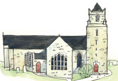
7. St Mulfose's Church