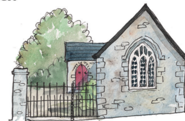
15. Fishermen's Hall