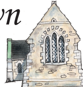
12. Methodist Church