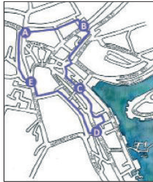
above: Approximate outline of the medieval town walls and gates.