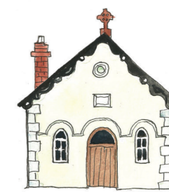
13. Temperance Hall