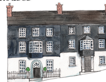
18. Houses, St John's Hill