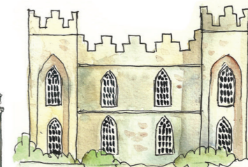
17 Municipal Building