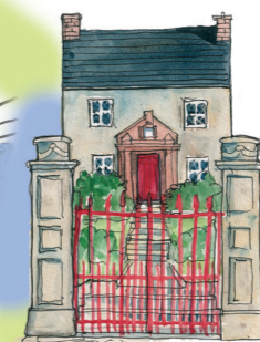
16. Giff houses