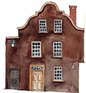
4. The Dutch House