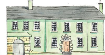
19. Custom House