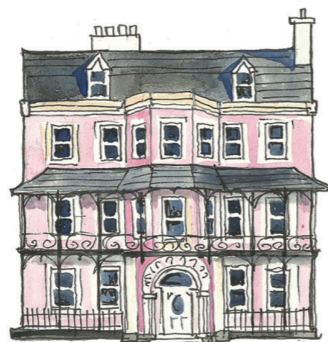
11. Perryville House