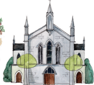
2. Our lady of Mount Carmel Church