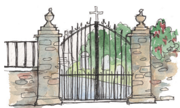
1. Site of Carmelite Abbey