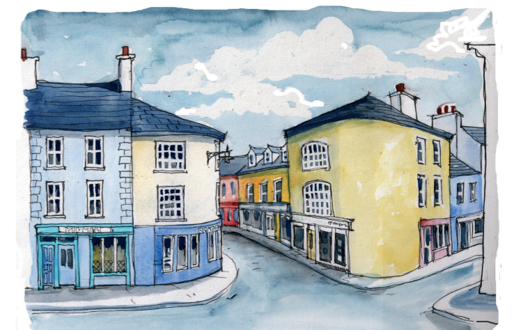
Market Square, Kinsale

Produced by CORK COUNTY COUNCIL COMHAIRLE CONTAE CHORCAÍ