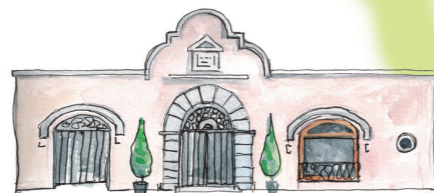
9. Old Fish Market