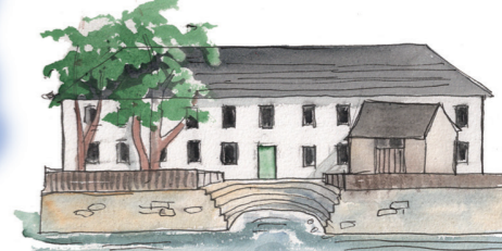
20. Fish palace and graving dock