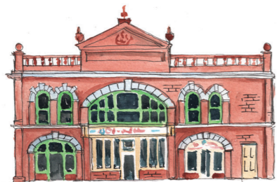
10. Commercial building